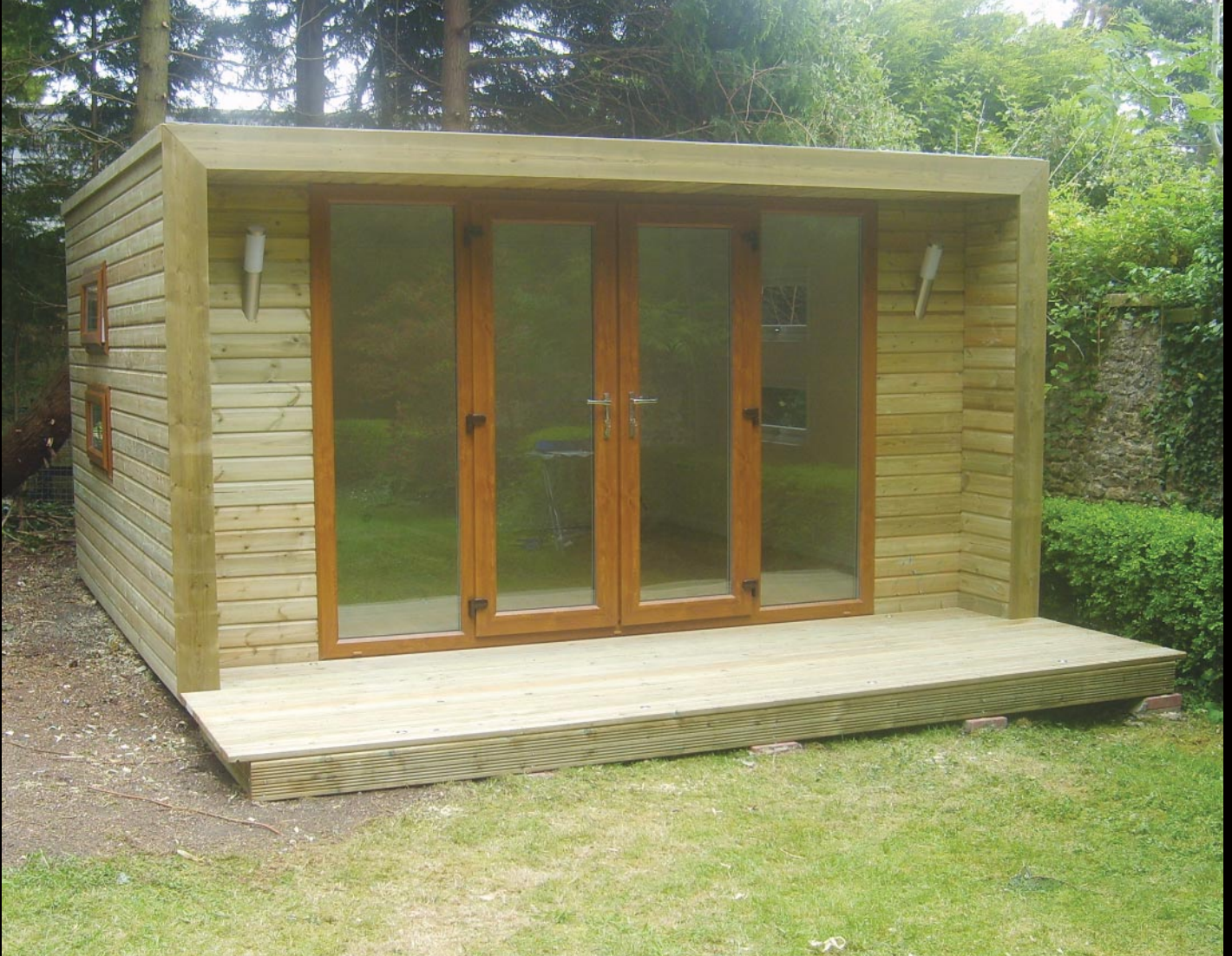
The Balmoral with Electric Upgrade, Additional Exterior Light, Two Additional Lozenge Window and Deck Extension Option